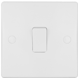
Plate switch, Ultimate Slimline, 2-way, screw terminals, IP20, white