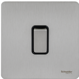
Plate switch, Ultimate Screwless flat plate, 2-way, screw terminals, IP20, stainless steel